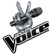
The Voice TV show