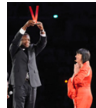
VMen end Violence against women