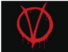
V For Vendetta movie

Take a look at just some of the images that are the "V" phenomena: