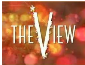
The View TV show