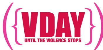
Until the Violence Stops movement