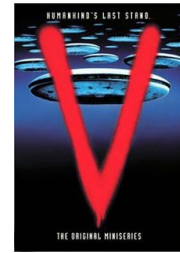
V - Original mini series

Take a look at just some of the images that are the "V" phenomena: