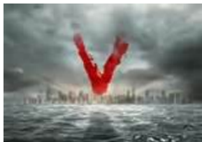
V - TV series remake