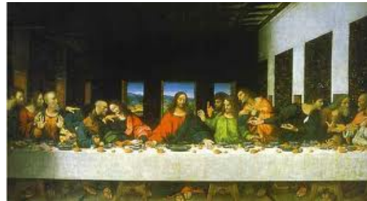
Michelangelo's The Last Supper (notice the "V" formed between Jesus and the one seated to his